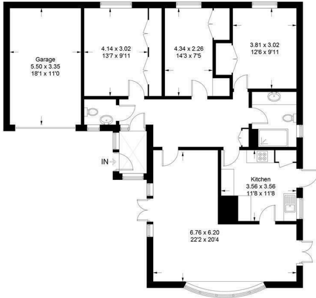
Illustration for identification purposes only, measurements are approximate, not to scale. Fourlabs.co © (ID1153198)

Approximate Gross Internal Area = 109.2 sq m / 1175 sq ft Garage = 18.4 sq m / 198 sq ft Total = 127.6 sq m / 1373 sq ft